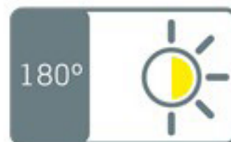
Change between 360° and 180° illumination