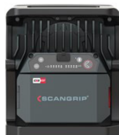
Closed battery cover

Comes with a detachable diffuser that spreads and softens the light avoiding hard shadows