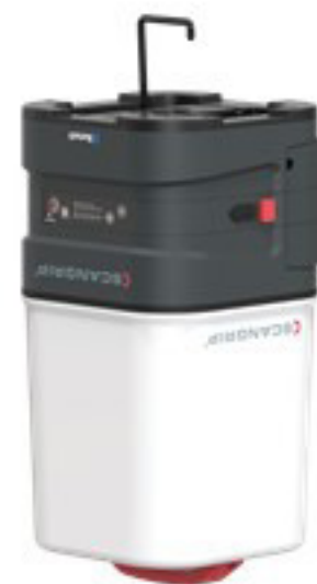
Hook for suspension